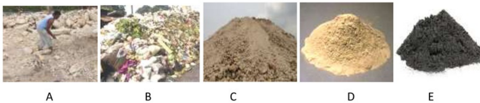
Figure 2 Mediteran soil (A) , Household waste (B), Clay (C), Fly ash (D), Bottom Ash (E)

Figure 2 below shows the organic cement raw material before the management process becomes organic cement concentrate.