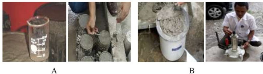
Figure 3 Bleeding measurement process (A), Air content measurement process (A)

For the air content measurement, it is obtained the results according to table 5 where in this research, the researchers also calculated the air content value of fresh concrete with organic cement test sample compared with the air content value of fresh concrete with portland cement. In Figure 3 A it shows the process of taking and measuring water bleeding between a concrete cylinder with organic cement and a concrete cylinder with portland cement and In figure 3 B it shows the measuring process of air content percentage of fresh air concrete in both organic cement concrete and portland cement concrete. The reference in this air content testing is ASTM C 231-03 [21].