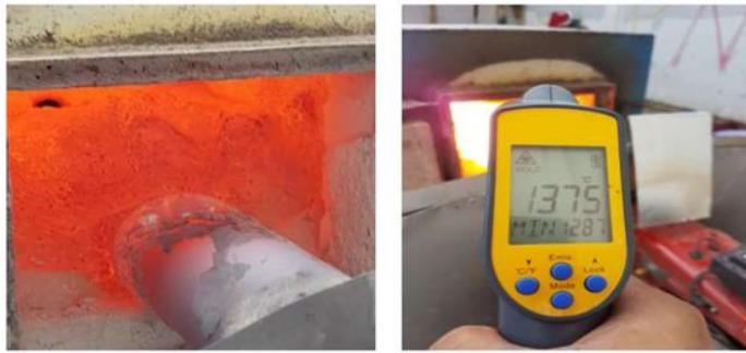
Figure 1. The burning process of the organic cement main ingredients.

To form an organic cement concentrate, all the main ingredients are burned to a temperature of 1400^{\circ}\text{C} . After all ingredients are burned for 4 hours, cooling and refinement are performed. The concentrate-shaped material is then subjected to chemical compound testing to see the chemical element feasibility approach to the portland cement chemical element and physical properties test to see the physical feasibility of organic cement in the form of fineness, density, initial and final Setting time, and the normal consistency and application against use in the building in the form of concrete testing to see the feasibility of fresh concrete and hard concrete.